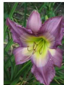
An older favorite in my gardens.