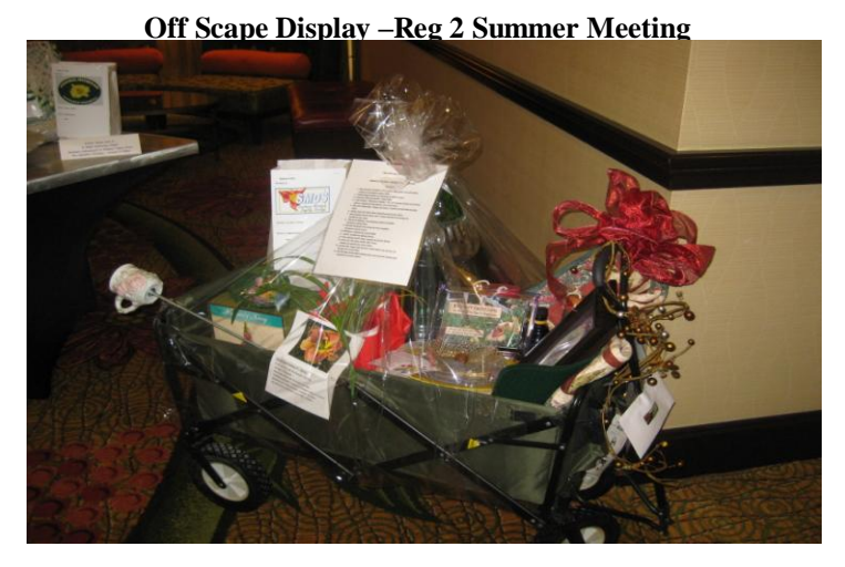
SMDS Basket (Wagon) for the Basket Bout