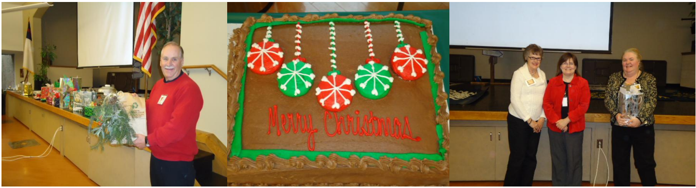
Jim Vrable and gifts

There is a wonderful photo of the Crabtree gardens on the front cover of your 2011 Fall Region 2 Newsletter. The picture was taken during the summer tour by Suzanne Eck of Woodstock, Illinois.