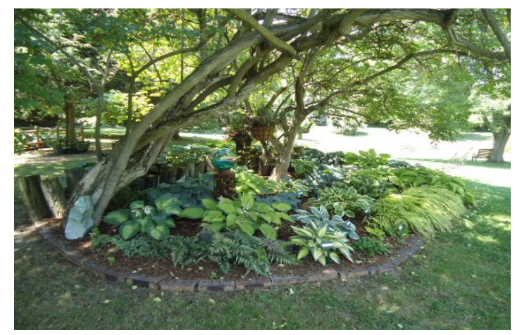
Salk's shade area: Volunteers worked here sorting, washing and tagging bus plants for the regional tours