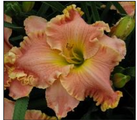
Putting on the Ritz (Douglas 2014)

Saturday, April 12, 2014 Social Hour at 5:00 PM - Dinner at 6:30 PM