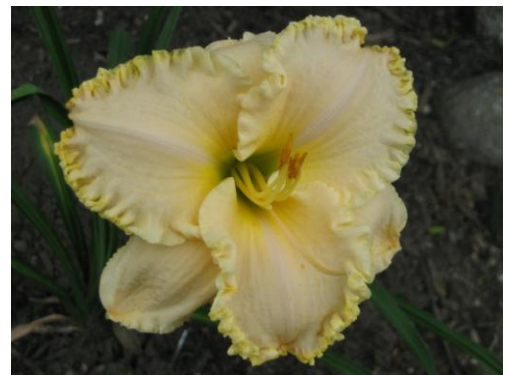
Browns Ferry Peaches N' Cream (Douglas 08)