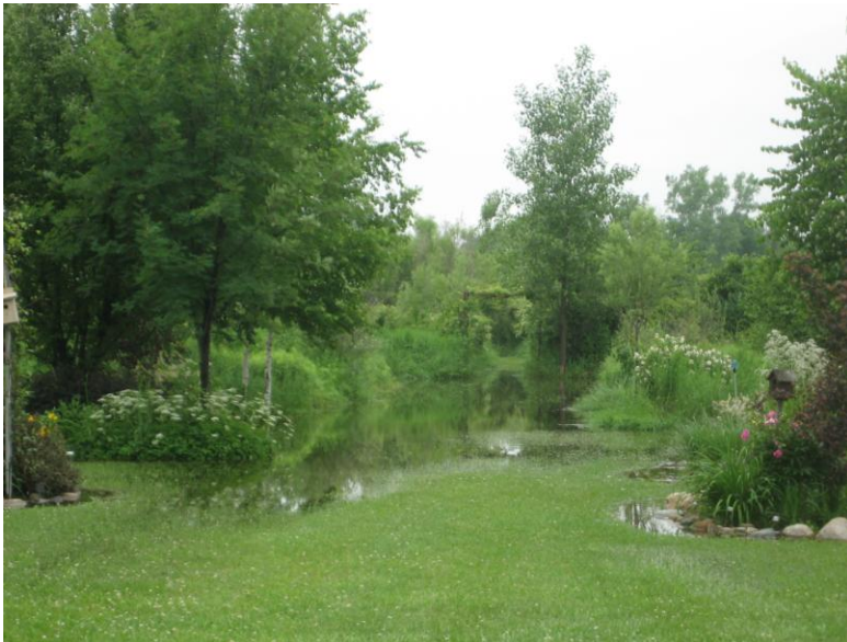
This picture was taken in June 2008 in my back yard.

We are all gardeners. That covers a broad spectrum; everything we share here does not have to relate to daylilies.