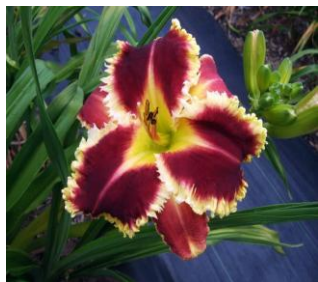
ARMED TO THE TEETH (2014 Polston)

5.5" Tet. on a 30" scape. "Armed sports 3-4 way branching and 15 - 18 buds per scape.(seedling. x seedling) Dormant re-blooms. Often it has a 'pillowing' effect on one or more petals.The picture says it all...this bright red flower with Cream/white shark teeth is a standout in the garden. Fertile both ways but a reluctant pod parent.