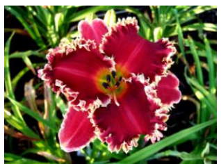
VAN HELSING (2013 Polston) 2012 Jr. Citation Winner 26" scape 5.5" bloom -25

scape with 4-way branching and 18-20 buds per scape. (seedling X seedling)Very striking clean red background color, white teeth of both the petals and sepals. This one is producing some standout kids, very pod fertile and will be a fantastic addition to your collection. Fertile both ways.