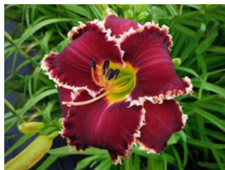
HEXENBEAST (2014 Polston) 4" tet. 30" scape carries 3-way branching and 12-15

height 26in (66cm), bloom 5.5in (14.0cm), season MLa, Rebloom, Dormant, Tetraploid, 15 buds, 4 branches, Pink with a darker rose eye and edge, ruffled and very toothy edge above a green to yellow throat. (Ruffled Strawberry Parfait x Deadliest Catch)