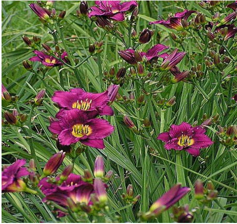
Velvet Shadows (Hudson 1981) A favorite for its extended bloom season and show winning qualities.