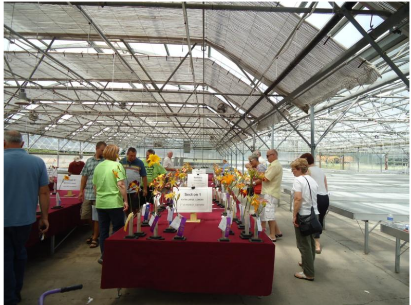
2012 SMDS Daylily Show at Bordines

What could you dream up and create for a people’s choice FLORAL DESIGN?