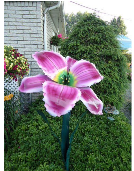
Metal Daylily Sculpture "Barbara Delisle"

In addition, monetary awards will be given by the John Kulpa Teeth and Tentacles Award: