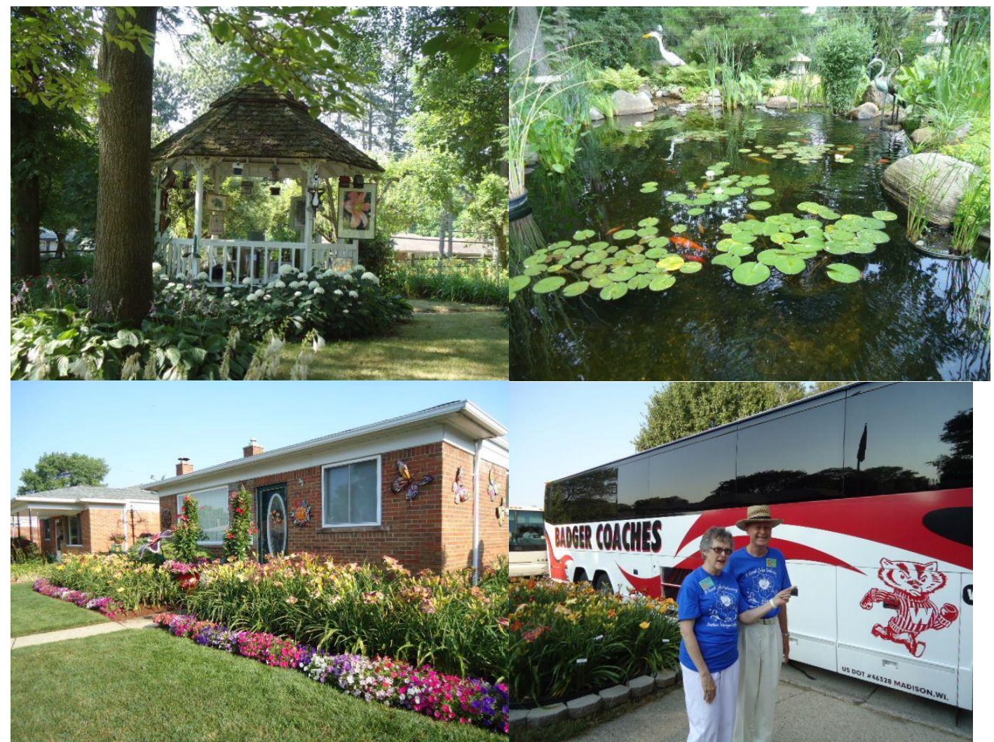
1.Webster garden 2. Cischke pond 3. Kulpa garden 4. Barb & Armand Delisle