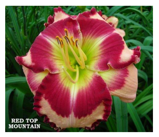
Red Top Mountain 2011 Introduction by