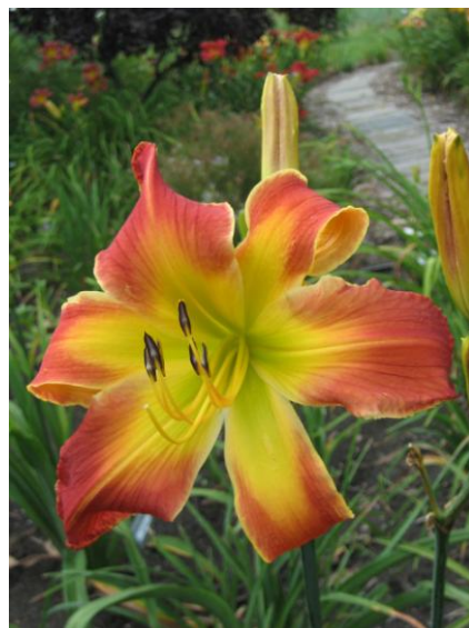
Panic in Detroit (Adams-R., 2002) (right) Picture taken in Dillon garden.

His daylily introduction “Panic in Detroit” got lots of attention in 2002 during the AHS National Convention. It is a tall beauty and produces more buds than as it was registered.