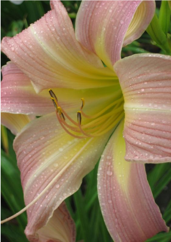
Orchid Corsage ( Saxton, 1975)

I entered nine flowers in my first show and took home the following awards: