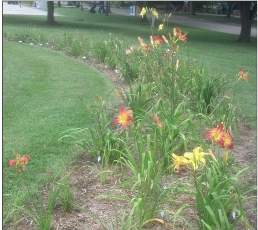
Detroit Zoo SMDS Bed during early bloom season.

BONUS: Once you have finished working in the zoo bed, you are free to enjoy the rest of the zoo at your leisure...check out the other zoo beds for inspiration. Enjoy visiting the animals. Meet your family or friends & make a day of it. If you sign up for a session with a few of your Daylily Buds...you can do it all!