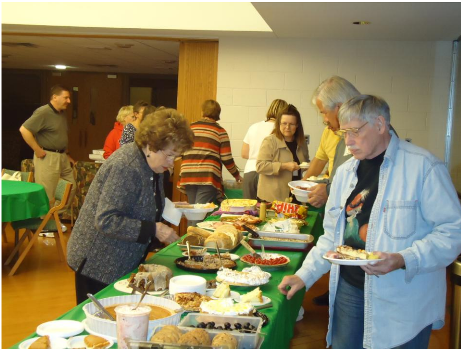
Members line up to partake of the assortment of potluck dishes.

Those in attendance feasted on a wonderful assortment of good food and desserts. The election went off without a hitch and we moved on to a virtual tour of the 2012 AHS Summer Convention Garden Tours in Columbus, OH., prepared by Kathy Rinke. Photos were submitted by club members. Fantastic job on the arrangement, Kathy! Thank you!