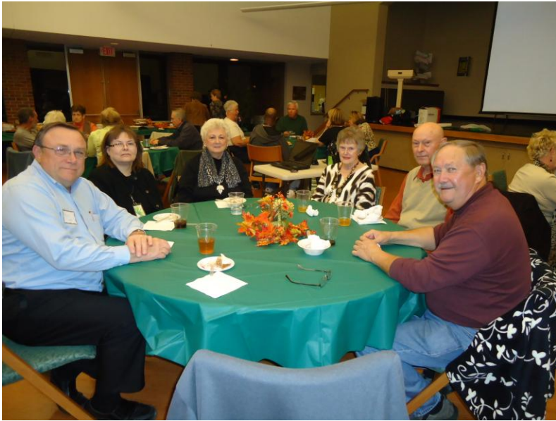
Some scenes from the October Potluck meeting.