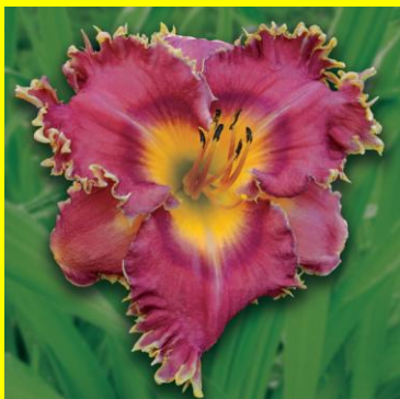
Root Canal (Hanson 2012)